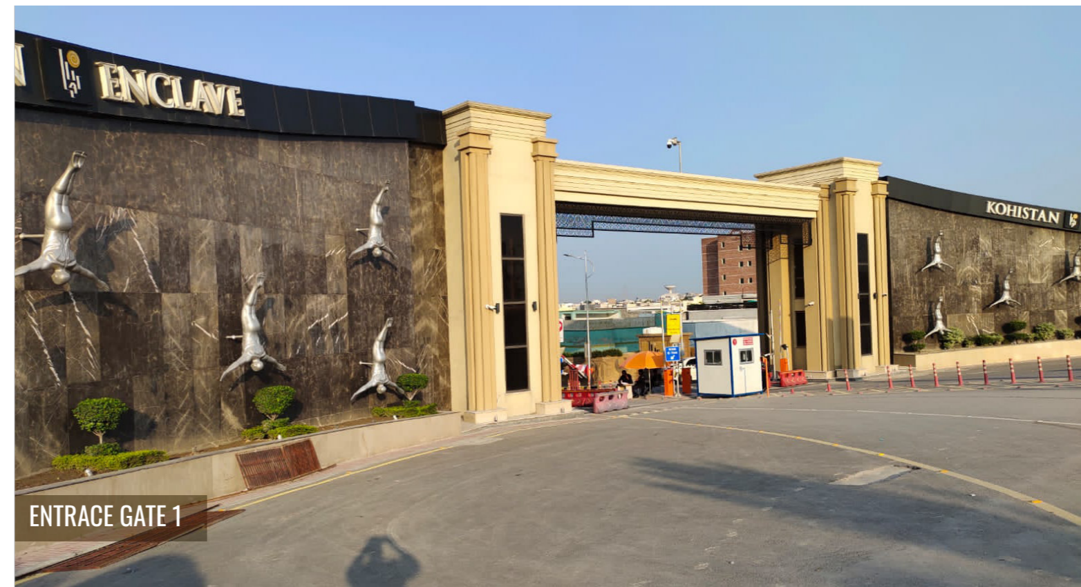
ENTRANCE GATE 1