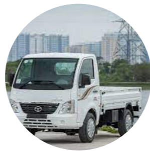
PICKUP ( QUANTITY: 4)