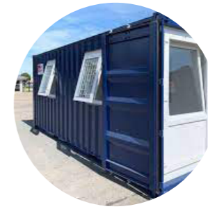
SITECONTAINER (03 SHOTS)