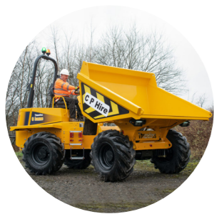
DUMPER ( QUANTITY: 5)