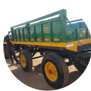
TRACTOR TRALLY ( QUANTITY: 2)