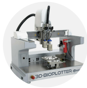
SCAFFOLD PLOTS (200,000 sq.ft)