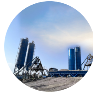
CONCRETE PLANT (03 SHOTS)