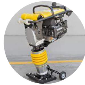
JUMPER COMPACTION ( QUANTITY: 10)