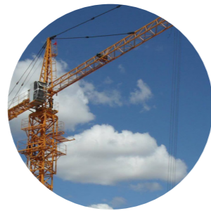
TOWER CRANE ( 8 TON )