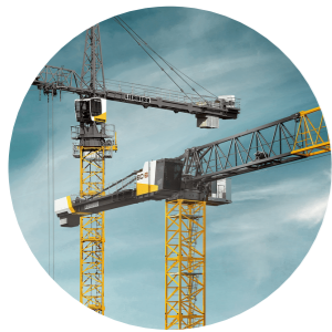
TOWER CRANE ( 6 TON )