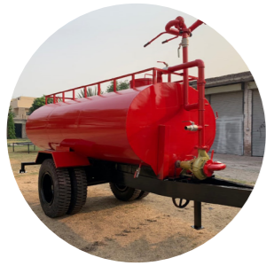
TRACTOR WATER BOWSER